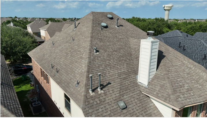
Project: 20807 S Blue Hyacinth Dr Cypress Date: Jun 2, 2025, 2:51 PM