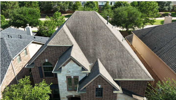
Project: 20807 S Blue Hyacinth Dr Cypress Date: Jun 2, 2025, 2:50 PM